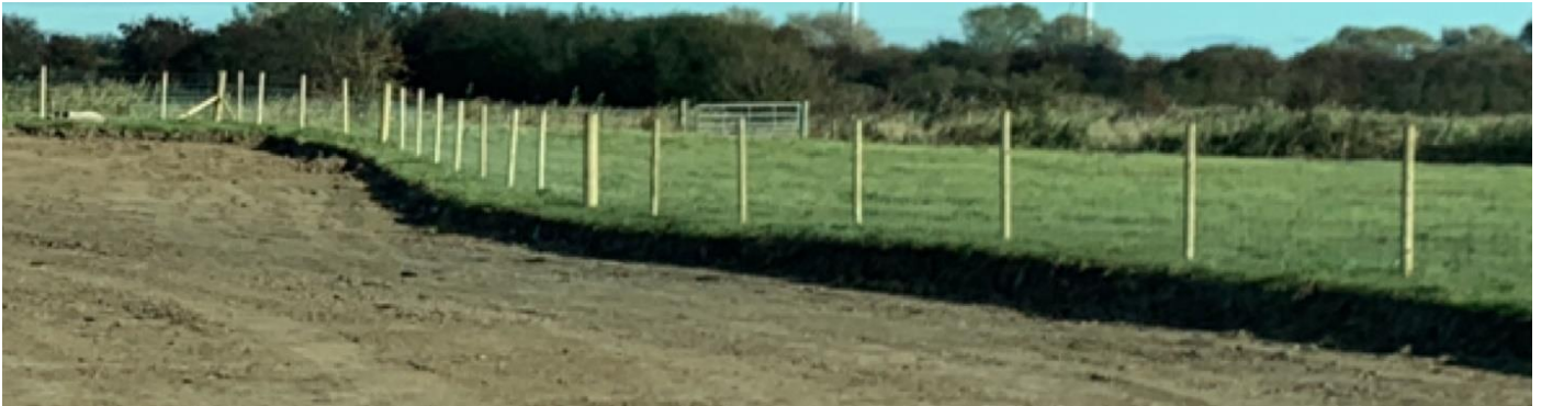
Figure 1.2: Example of post and wire fencing

1.6.4.2 An example of typical post and wire fencing is shown in Figure 1.2 below.